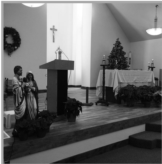
Holy Family Church - Christmas 2014

Rosary before Mass will begin again in Lent.